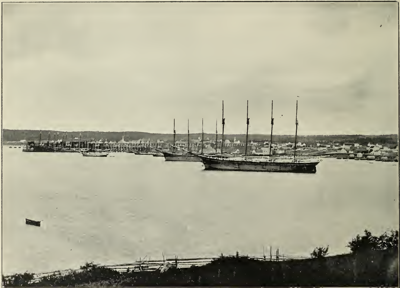
HARBOR AT LOUISBURG, SHOWING DOMINION COAL COMPANY'S PIER.